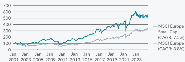
Graph 1: Long term performance MSCI Europe Small Cap vs MSCI Europe